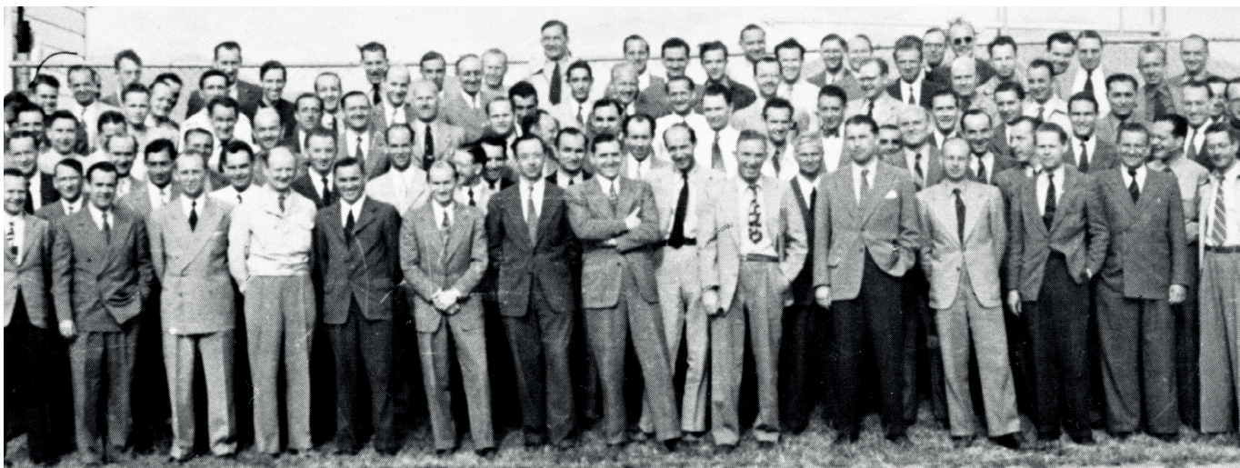
With the secretive mission Operation Paperclip, the American government brought more than 1,600 Nazi researchers (and their families) to the United States. In this way, knowledge, experience and research along with advanced military technology, aircraft technology, chemical and biological weapons were brought to the country. Knowingly, and concealed, that some of these researchers had been involved in experiments with Humans used as Guinea Pigs.

However, it seems as though transhumanism and eugenics have slipped in ‘through the back door’ in the wake of technological developments, especially with the ongoing trend towards ever more automation in society. As a result, technical, instrumental and managerial modes of thought have become dominant, giving rise to an undeclared technocratic approach that underlies decision-making in many modern nations and undermines a more humane self-understanding.