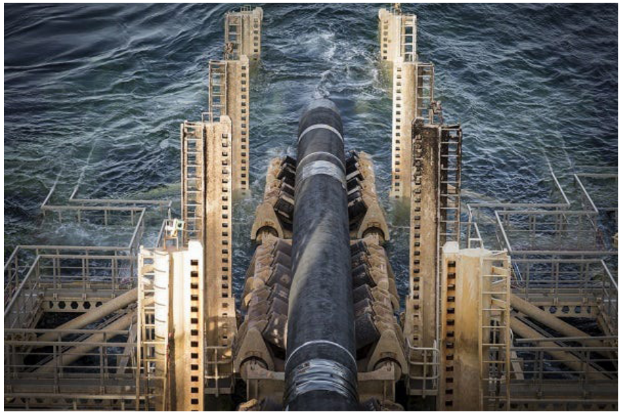
Pipelaying vessel at work on Nord Stream 2.

By the end of the exercise, Hersh writes, the US Navy special divers had planted the explosives. They had used highly specialised deep-sea diving equipment with a mixture of helium in the tanks. These divers had nothing to do with the military exercise itself. According to German journalist Thomas Röper [21], their presence was confirmed by a BALTOPS coordinator for the divers. The divers were flown in by helicopter and brought deep-sea diving equipment with them, which the coordinator believed was MK29 [22], a rebreather system using a mixture of helium (as mentioned by Hersh) that had been developed by the Naval Warfare diving Centre in Panama City. Such equipment was neither necessary nor useful for divers in a mine warfare exercise, and their use of it had surprised the coordinator. These divers also met with the US Admiral and “with a group of American men in plain clothes, who arrived a few hours later”, according to the diving coordinator’s letter [23]. On the 1st of December 2022, I wrote an article in the Norwegian Ny Tid , where I pointed to the BALTOPS 22 exercise and the possible use of USS Kearsarge . The BALTOPS was the obvious cover, and almost everyone would understand that the perpetrators had used this exercise to plant the explosives, par-