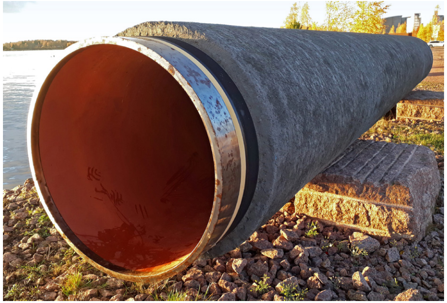
A section of steel pipe for Nord Stream 2 with concrete coating.