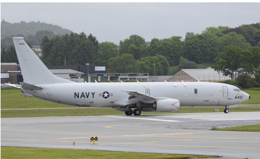
A US Navy Poseidon P-8A at Sola Air Base, southern Norway in 2017.

Second , why did this Poseidon keep circling in the area east of Bornholm for more than three hours? Circling over the southern Baltic in the middle of the night after the most devastating sabotage operation ever, would suggest that this aircraft had something to do with the operation. However, it can hardly have been the perpetrator—if it had been, it would have left the area as soon as possible. This “second Poseidon” apparently arrived in the area just after the first explosion. Its task might have been to confirm that the explosion had been executed and then survey the southern Baltic Sea to find out