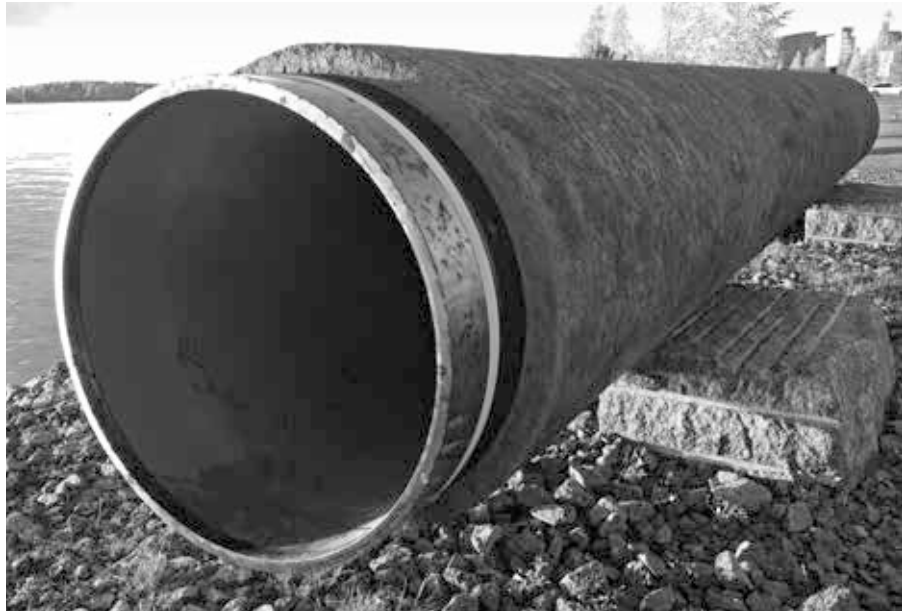
A section of steel pipe for Nord Stream 2 with concrete coating.

This text was first published on March 21, 2023 at https://olatunander.substack.com/p/after-sy-hersh-article-norway-the Licence: Ola Tunander, Free21, CC BY-NC-ND 4.0