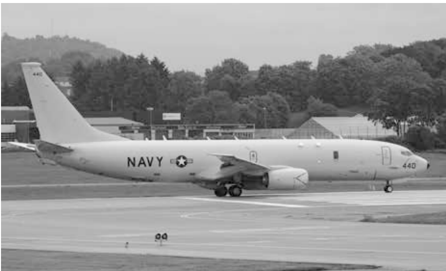
A US Navy Poseidon P-8A at Sola Air Base, southern Norway in 2017.

Second , why did this Poseidon keep circling in the area east of Bornholm for more than three hours? Circling over the southern Baltic in the middle of the night after the most devastating sabotage operation ever, would suggest that this aircraft had something to do with the operation. However, it can hardly have been the perpetrator—if it had been, it would have left the area as soon as possible. This “second Poseidon” apparently arrived in the area just after the first explosion. Its task might have been to confirm that the explosion had been executed and then survey the southern Baltic Sea to find out