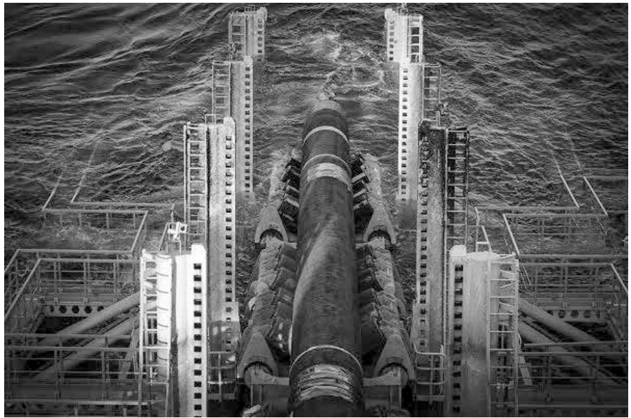
Pipelaying vessel at work on Nord Stream 2.

By the end of the exercise, Hersh writes, the US Navy special divers had planted the explosives. They had used highly specialised deep-sea diving equipment with a mixture of helium in the tanks. These divers had nothing to do with the military exercise itself. According to German journalist Thomas Röper [21], their presence was confirmed by a BALTOPS coordinator for the divers. The divers were flown in by helicopter and brought deep-sea diving equipment with them, which the coordinator believed was MK29 [22], a rebreather system using a mixture of helium (as mentioned by Hersh) that had been developed by the Naval Warfare diving Centre in Panama City. Such equipment was neither necessary nor useful for divers in a mine warfare exercise, and their use of it had surprised the coordinator. These divers also met with the US Admiral and “with a group of American men in plain clothes, who arrived a few hours later”, according to the diving coordinator’s letter [23]. On the 1st of December 2022, I wrote an article in the Norwegian Ny Tid , where I pointed to the BALTOPS 22 exercise and the possible use of USS Kearsarge . The BALTOPS was the obvious cover, and almost everyone would understand that the perpetrators had used this exercise to plant the explosives, par-