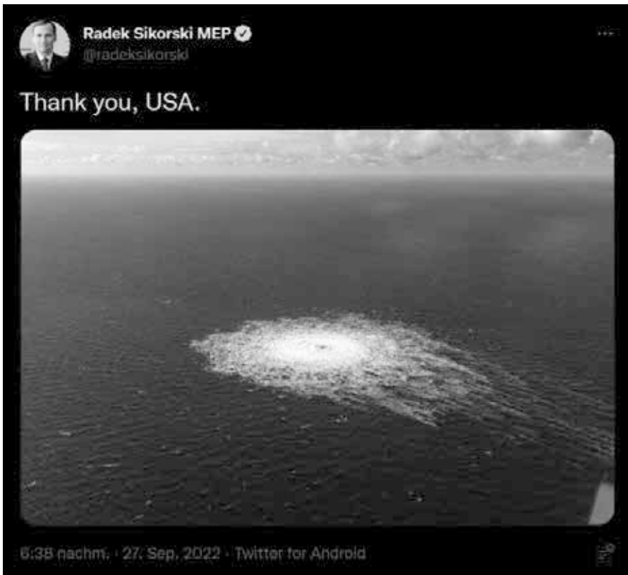
Member of the European Parliament and former Minister of Defence and Foreign Affairs Radosław (Radek) Sikorski's Twitter comment "Thank you, USA", 27 September 2022.

R. Ford [46] and the NATO Joint Forces Command in Norfolk, close to Washington, DC. They were accompanied by the US Secretary of the Navy, Carlos Del Toro. They visited the headquarters of the US Second Fleet and of the NATO Command, where they also spoke with the Norwegian officers stationed there. In the evening, Prime Minister Støre met Nancy Pelosi and Mitch McConnell at the Congress [47]. On the 20th of September, Støre attended the opening of the UN General Assembly in New York [48] and had a meeting with the UN Secretary General António Guterres [49]. Støre delivered his speeches for Norway before the General Assembly [50] and at the Security Council on the 22nd of September [51], both on the same day. In the evening, before returning to Norway, he participated in a transatlantic foreign ministers' meeting led by Anthony Blinken.