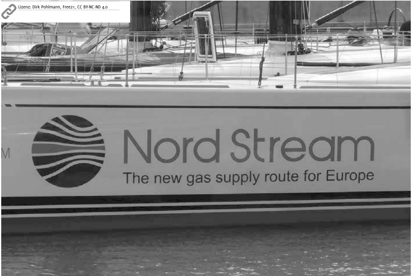
Nord Stream Logo

Lizenz: Dirk Pohlmann, Free21, CC BY-NC-ND 4.0