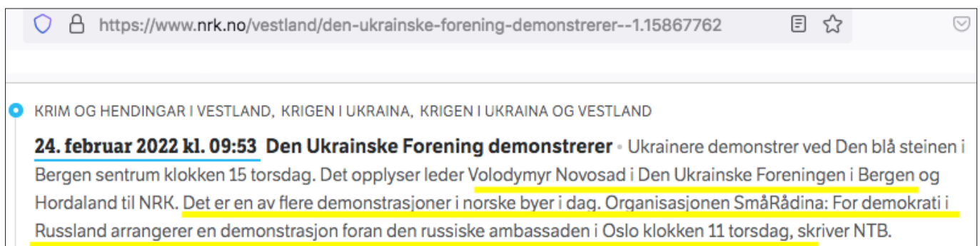
Image 1: This appeared in the news-ticker of NRK; the highlighted sentences translate as follows: 'This is one of many protests in Norwegian cities today. The organisation "SmåRådina: For Democracy in Russia" has organised a protest outside the Russian embassy in Oslo at 11 a.m. on Thursday'.

"Russian President Vladimir Putin said on Tuesday that he did not want war. He has also said that Russia has started a partial withdrawal.