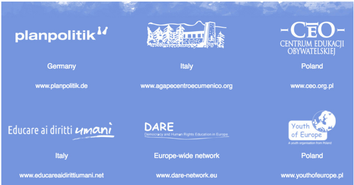
Image 3: Partners of TEVIP (Translating European Values into Practice)

only little contact with Europe-related topics before. Most activities have been developed for use in non-formal education but may also be used by teachers in formal education. They can also be used by international youth groups at European youth events, camps etc. (emphasis in the original)