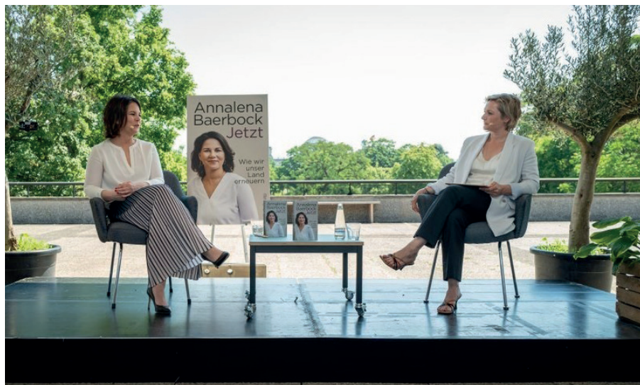
Annalena Baerbock presents her book „Jetzt. Wie wir unser Land erneuern“ "Now. How we renew our country", in which she plagiarized diligently.

openly spoke of the West's complicity in the war, mainstream media had finally had enough. She became an Anti-vaxxer, a Corona Denier [Corona-Leugner], and a Putin Propagandist [Putin-Versteher].