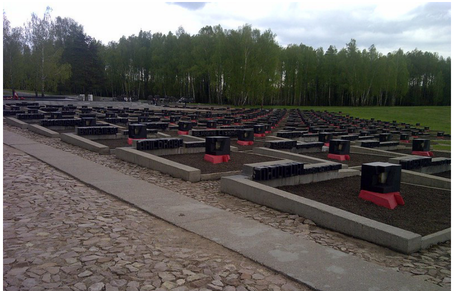
Cemetery of villages in the memorial Khatyn: 186 graves, one for each village.

The “Kriegsgerichtsbarkeitserlass”, also known as the Barbarossa decree, was issued on 13 May 1941 by the High Command of the Wehrmacht and exempted “deeds committed by members of the Wehrmacht towards civilians from military jurisdiction”. This was extended to include actions that were military crimes or offences. In other words, the German soldiers were given a carte blanche, placing Soviet civilians at the mercy of arbitrary decisions and the caprices of local