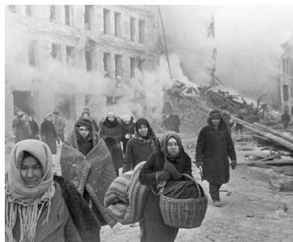
Soviet civilians leave their destroyed houses after a bombardment by the German Army during the battle for Leningrad, 10 December 1942

the Russians, defeat the West and, after its defeat, gather my forces to fight the Soviet Union. I need Ukraine to ensure that we will not be starved again as we were during the last war.” From the perspective of the aggressors, the “Eastern Lebensraum” Hitler had vaguely alluded to as a distant ideological goal in “Mein Kampf” – the conquest of the Soviet Union up to the Urals and the accompanying expulsion, enslavement, and murder of the local populace – had become an “urgent necessity of war” by the spring of 1941.