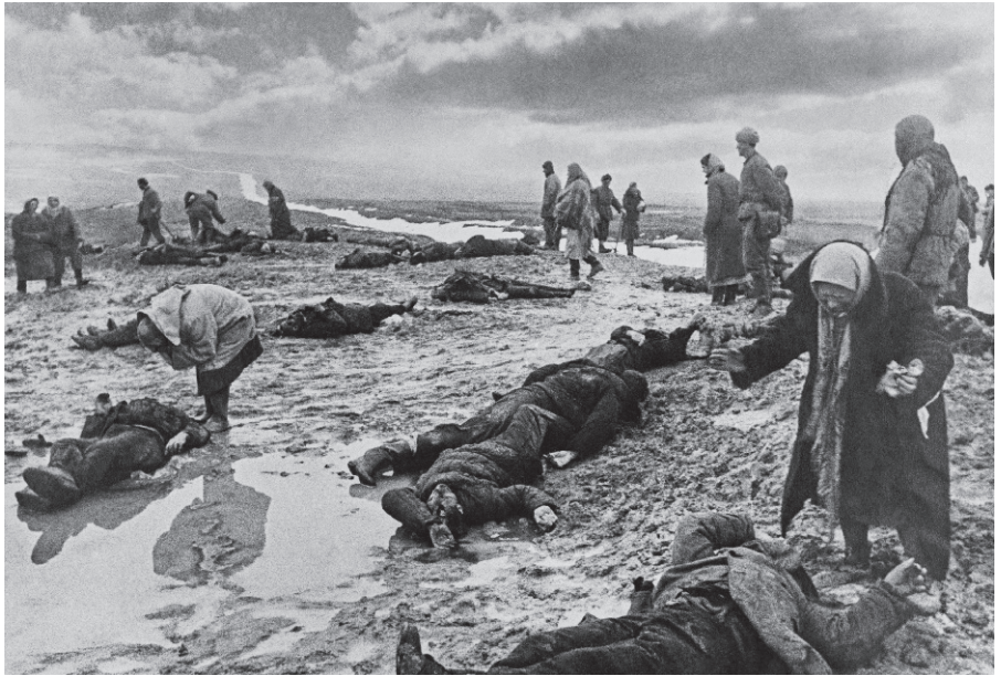
Russian mothers clear the corpse field after the battle of Kerch in 1942.