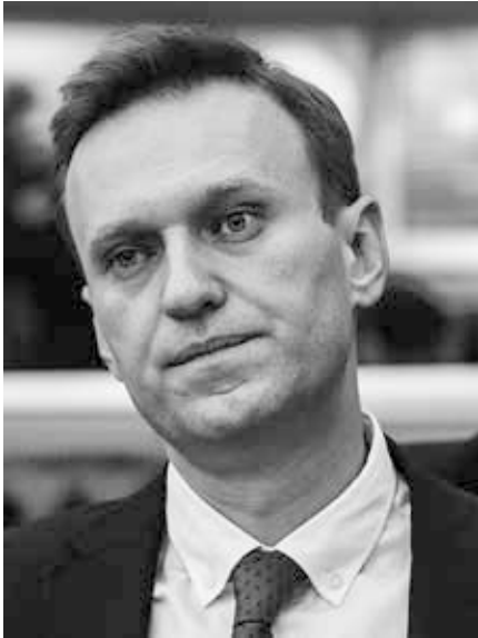
Alexei Navalny, Russian opposition leader, at Central Election Commission's session which is about to deny his right to be in the ballot on the upcoming presidential elections, December 25, 2017

Instead, they report that it was the "Bundeswehr [German Army] Institute of Pharmacology and Toxicology (IPTB) in Munich, Germany, who did repetitive measurements of butyrylcholinesterase, acetylcholinesterase in red blood cells, and cholinesterase status and gave toxicological advice." For more on this military unit and its role in the Navalny Novichok operation, read this [19] and this [20].