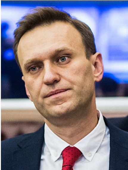
Alexei Navalny, Russian opposition leader, at Central Election Commission's session which is about to deny his right to be in the ballot on the upcoming presidential elections, December 25, 2017

Instead, they report that it was the “Bundeswehr [German Army] Institute of Pharmacology and Toxicology (IPTB) in Munich, Germany, who did repetitive measurements of butyrylcholinesterase, acetylcholinesterase in red blood cells, and cholinesterase status and gave toxicological advice.” For more on this military unit and its role in the Navalny Novichok operation, read this [19] and this [20].