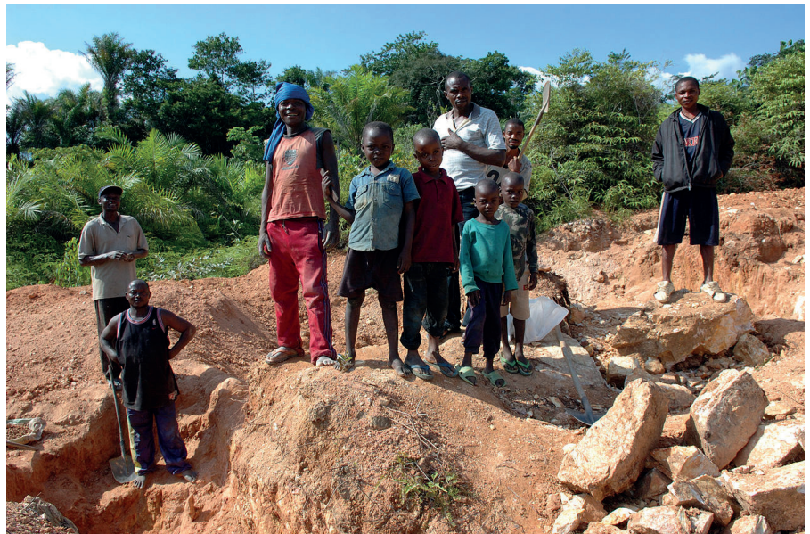
Child labor in mining: Children work together with their parents in Kailo, Congo on 10/31/2007

brought the atrocities of the LRA to international attention. But US Special Operations Command documents suggest that the film's producer, the NGO Invisible Children, was unwittingly part of a US psychological warfare operation [34]. Army Special Operations Forces name the Congolese and Ugandan militaries, as well as several NGOs including Invisible Children, as "partners" in their operations. Unlike the first attempt, Observant Compass reduced the LRA's numbers and notoriety.