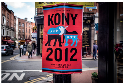
Poster for Invisible Children Inc.'s KONY 2012 campaign on the streets of Dublin, Ireland on 04/01/2012

https://www.statista.com/statistics/271537/worldwide-revenue-from-electric-vehicles-since-2010/