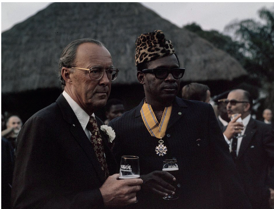
Prins Bernhard with President Mboetoe in Zaire on August 12, 1973

making it one of the poorest countries in the world. As trillion-dollar companies like Apple, Microsoft and Tesla rely on DRC's materials [6], seven in 10 Congolese survive on less than $1.90 a day [7]. Life expectancy is 60 years [8], compared to 78 in the US [9], and infant mortality is 66 deaths per 1,000 live births [10] compared to 5.6 in the US [11].