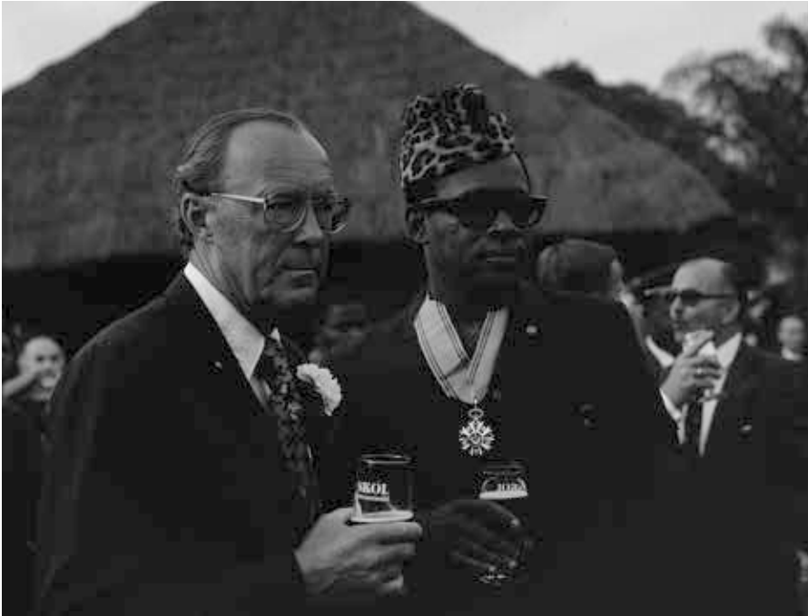
Prins Bernhard with President Mboetoe in Zaire on August 12, 1973

making it one of the poorest countries in the world. As trillion-dollar companies like Apple, Microsoft and Tesla rely on DRC's materials [6], seven in 10 Congolese survive on less than $1.90 a day [7]. Life expectancy is 60 years [8], compared to 78 in the US [9], and infant mortality is 66 deaths per 1,000 live births [10] compared to 5.6 in the US [11].