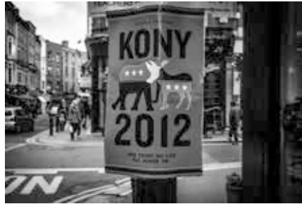
Poster for Invisible Children Inc.’s KONY 2012 campaign on the streets of Dublin, Ireland on 04/01/2012

https://www.statista.com/statistics/271537/worldwide-revenue-from-electric-vehicles-since-2010/