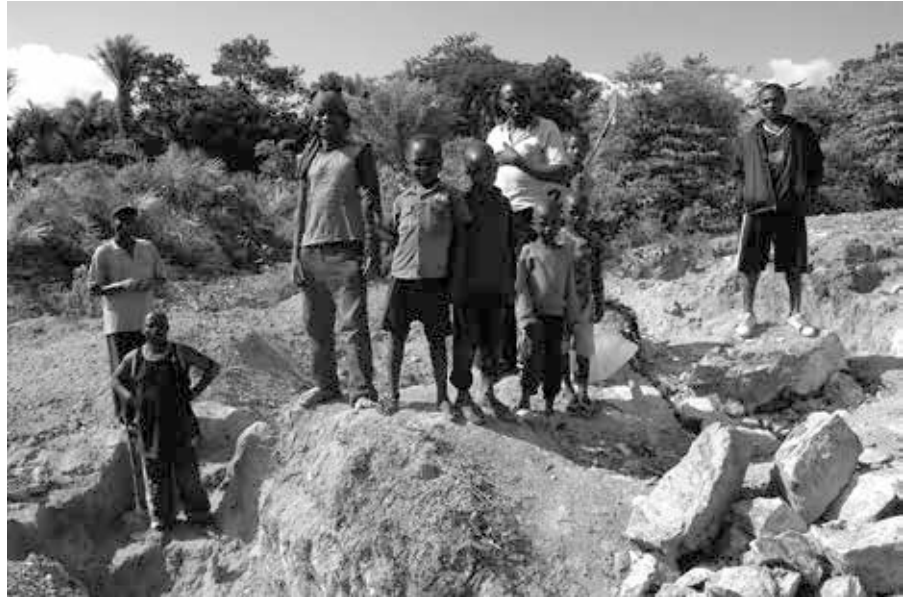
Child labor in mining: Children work together with their parents in Kailo, Congo on 10/31/2007

brought the atrocities of the LRA to international attention. But US Special Operations Command documents suggest that the film's producer, the NGO Invisible Children, was unwittingly part of a US psychological warfare operation [34]. Army Special Operations Forces name the Congolese and Ugandan militaries, as well as several NGOs including Invisible Children, as "partners" in their operations. Unlike the first attempt, Observant Compass reduced the LRA's numbers and notoriety.