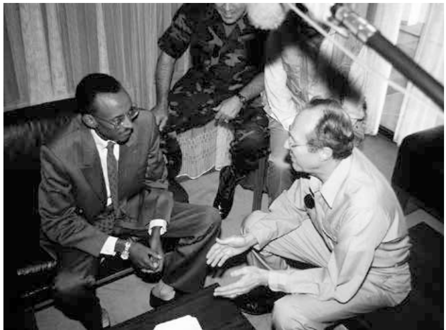
Defense Secretary William Perry and Rwandan Vice President Paul Kagame discuss the situation in Rwanda on July 31, 1994